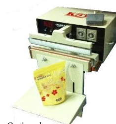
Optional : OSAKA Vertical Working Tray